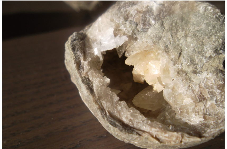
Dolomite and Dogtooth

In all, we walked away with 15 bracs that were crystal filled. However, the highlight of the trip was me finding an ultra rare snail. Not only was it a snail, it was geodized. Out of five trips to the site, this was the first time I found one.